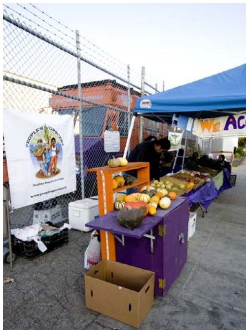
People's Grocery farm stand in West Oakland.

People's Grocery Market (PGM) proposes to open a full-line 76 grocery store in West Oakland, a low-income neighborhood with significant unmet demand for food retail. West Oakland currently lacks a full-service grocery store, forcing its residents spend over $50 million annually in food stores in other neighborhoods. 77 People's Grocery seeks to improve access to healthy food, create local jobs, and support local food businesses