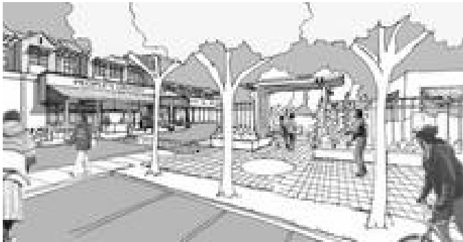
Rendering of proposed market.

People's Grocery Market has addressed environmental issues in defining its brand identity, saying "the brand will also convey strong values of social and environmental responsibility to capture shoppers seeking business that function on such values," but it has stated very little about its intended environmental practices.